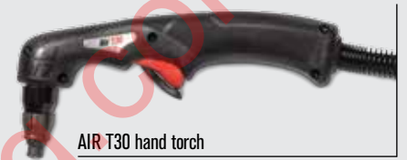
AIR T30 hand torch