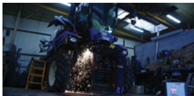
Agricultural and farm equipment maintenance