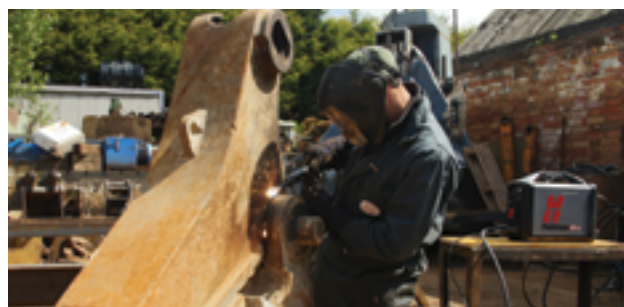
Maintenance and repair