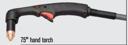
75° hand torch

(for more torch options, see www.hypertherm.com )